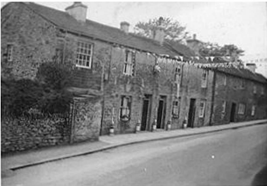
Figure 9: Two views of High Farnhill