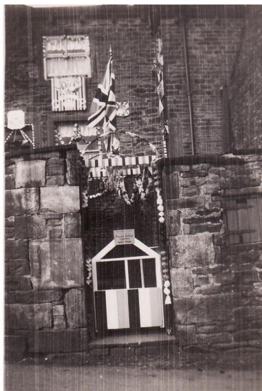
Figure 8: 12 Main Street, Farnhill, 6 th May 1935 - with the First Prize notice on the gate

They lived at 12 Main Street, Farnhill – in a house since demolished. (The area now occupied by the children’s playground.)