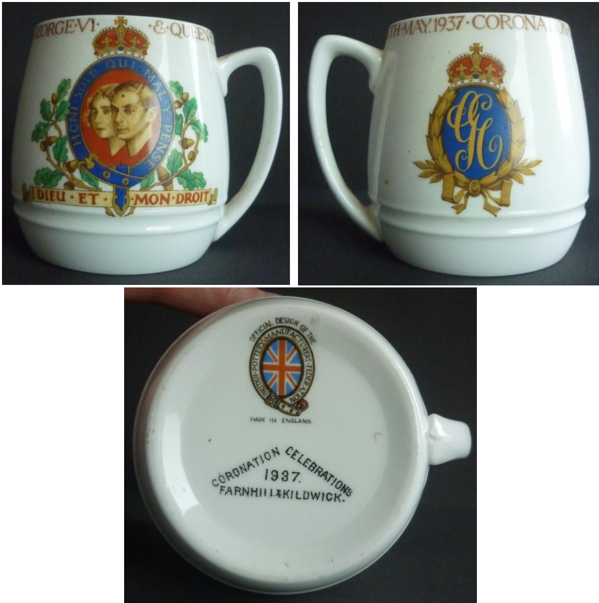
Figure 5: Souvenir mug design

In addition to the mug, children were also presented with two bars of chocolate. Of course most of these will have been eaten on the day or soon after but, remarkably, one example has survived.