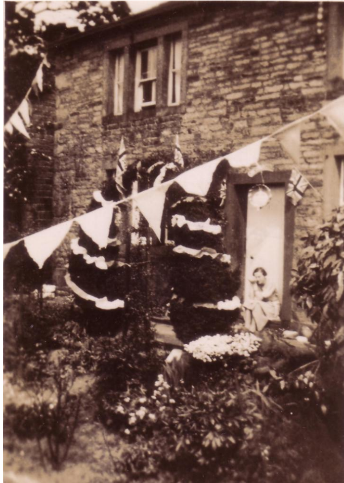
Figure 10: Verna Rishworth on the step of Hellifield House