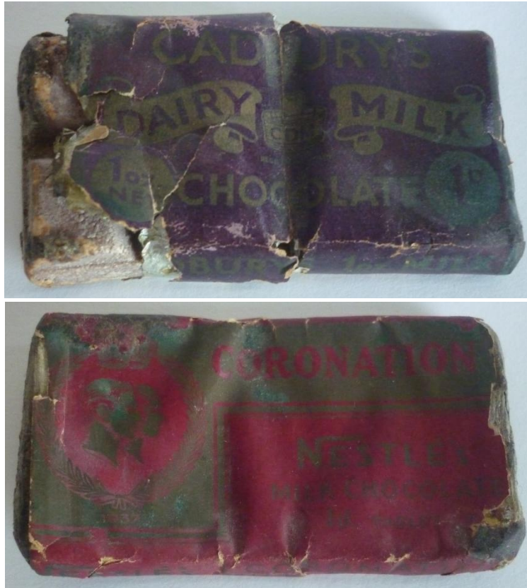
Figure 6: Souvenir bars of chocolate – now over 75 years old