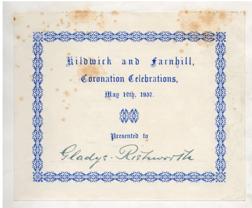
Figure 12: Label from the inside cover. Gladys Rishworth’s name appears on the committee list of “Under 14s at Secondary School”.