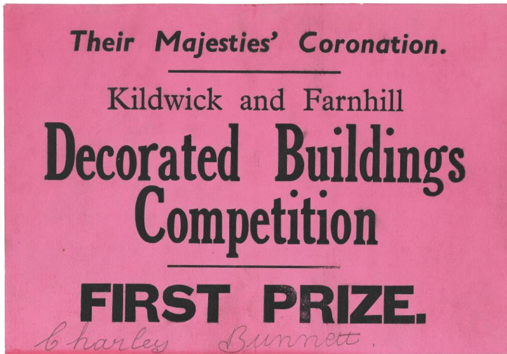
Figure 7: Best decorated house First Prize certificate