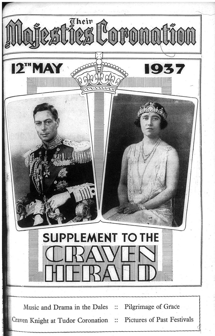
Figure 1: Craven Herald Coronation Supplement

The date for the coronation of his eldest son and successor was fixed for May 12 th 1937. In the event, Edward VIII was never crowned and, following his abdication and the accession of his brother on December 11 th 1936, the same date was chosen for the coronation of the new king, George VI and his queen, Elizabeth.